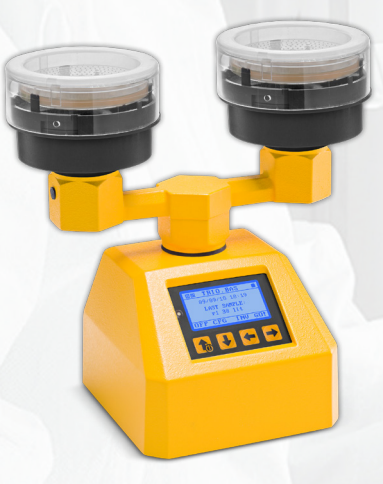
AIRBIO DUO CM