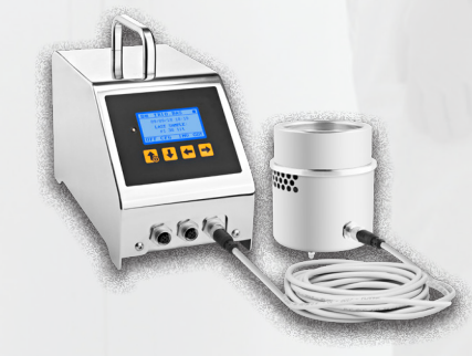
TRIO.BAS RABS ISOLATOR CM + 1 SATELLITE CM