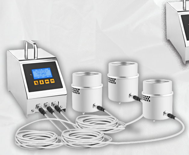
TRIO.BAS RABS ISOLATOR CM + 3 SATELLITES CM